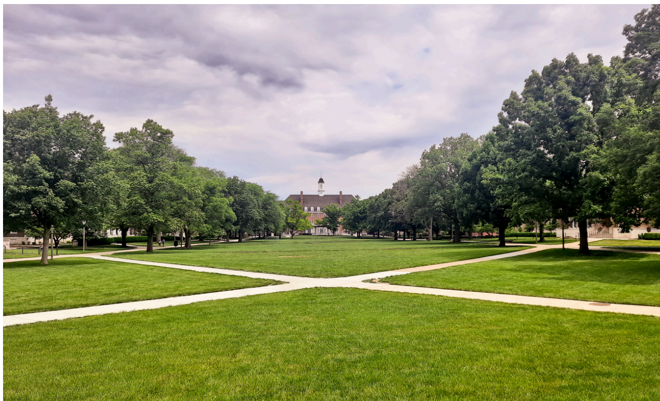
University of Illinois Urbana Champaign Quad